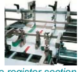
Feeder and side register section