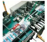
Delivery and motorized conveyor